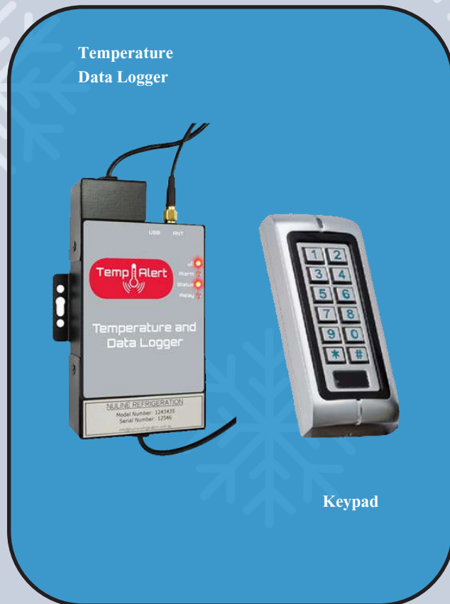
Temperature Data Logger