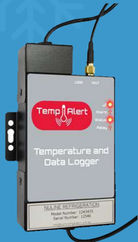
Temperature Data Logger