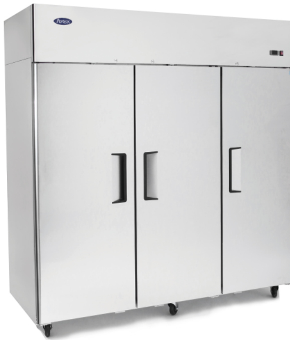
Top Mounted Three Door Refrigerator / Freezer