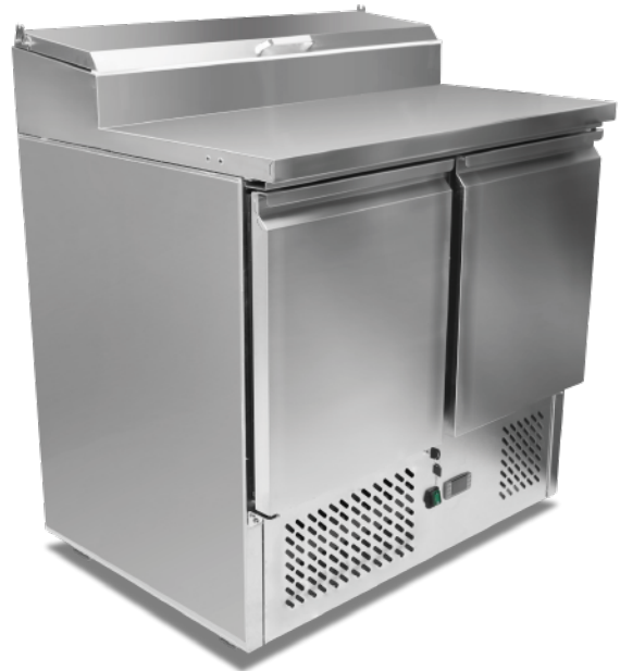
Two Doors Open Top Saladette