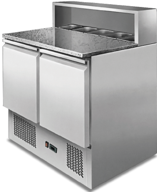
Two Doors Pizzatable Marble Top Saladette