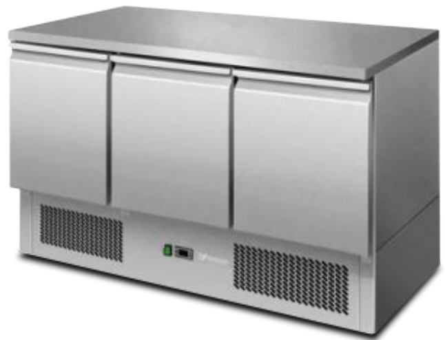
Three Doors Table Saladette