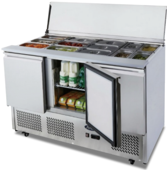
Three Doors Sliding Lid Saladette